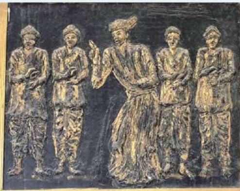
ধ্রুপদী প্ৰখ্যাতন এতিহাসে সমৃদ্ধ কাপন ওজপালি BYASA OJAPALI A PERFORMING ART FORM ENRICHED WITH THE HERITAGE OF CLASSICAL SONG.