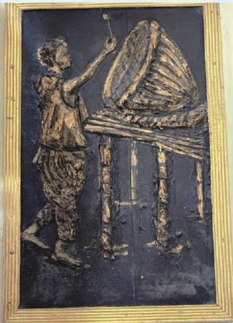
পৰিবেশন কলাৰ অন্যতম বাদ্য নাগাৰা NAGARA, A SPECIFIC FORM OF DRUM USED IN RELIGIOUS PERFORMING ART