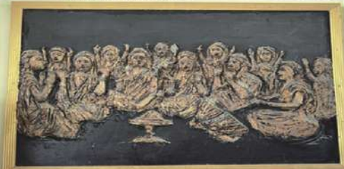
লোক পৰিবেশন কলাৰ অন্যতম অংশ নাগাৰী নান Lok Paribeshan Kalar Antyotom Ashang Nagari Nan