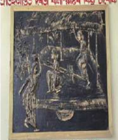
এতিহাসিক দৰঙী বনা-কঠিন নিচু চানেকি DICHU IS A KIND OF EFFECTIVE TECHNICAL DEVICE FOR HILLING CROPS IN RURAL ASSAM.