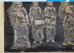
সুখানামি ওজপালি কাপন মুখোৰী মূৰখী নান SUKHANAMI OJAPALI, A SPECIFIC DANCE FORM OF SUKHANAMI OJAPALI.